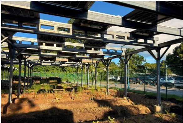
Vegetable garden underneath solar panels