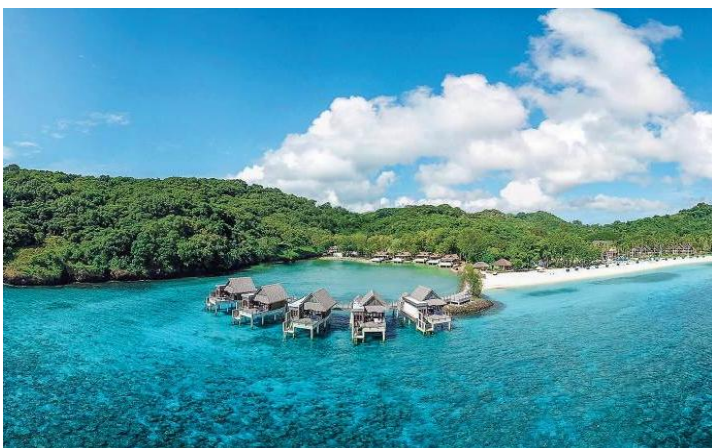
Panoramic view of Palau Pacific Resort

Palau Pacific Resort is blessed with the highly rare location of being surrounded by the West Pacific with its abundance of marine life and forests inhabited by numerous bird types that include species endemic to Palau and endangered species, making it possible to experience abundant forms of nature all at once. Leveraging this location, the resort will continue bolstering further initiatives with a view to the goal of transforming the Republic into a high-end eco-tourism destination, which has been adopted by the Government of Palau for the purpose of establishing a balance between protecting the Republic's natural environment and developing its tourism industry.