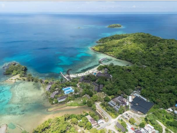
Panoramic view of solar power generation facility and hotel