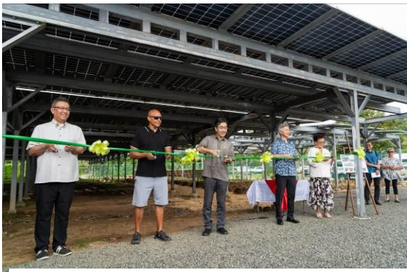
Scene from operation commencement ceremony