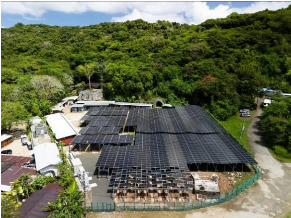
Panoramic view of solar power generation facility

*The aim behind the Subsidy Programme for the JCM Facility is to utilize exceptional decarbonization technologies, etc. to reduce greenhouse gas (GHG) emissions in partner countries; gauge, report, and verify the effects of those GHG reductions; JCM credits; and apply them to the achievement of GHG emission reduction targets in Japan.