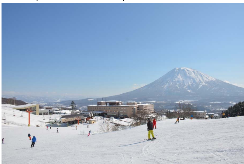
Hotel Niseko Alpen