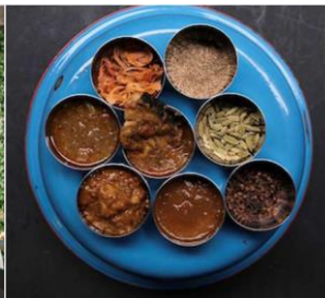
Illustrative image of "beet eat" menu