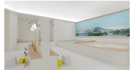
Illustrative image of Kosugi-yu Harajuku

A business set to open on the 1st basement floor is striving to create new culture and lifestyle. Kosugi-yu, a long-established sento public bathhouse in Koenji, will open Kosugi-yu Harajuku, suggesting a life with sento at Jingumae crossing.