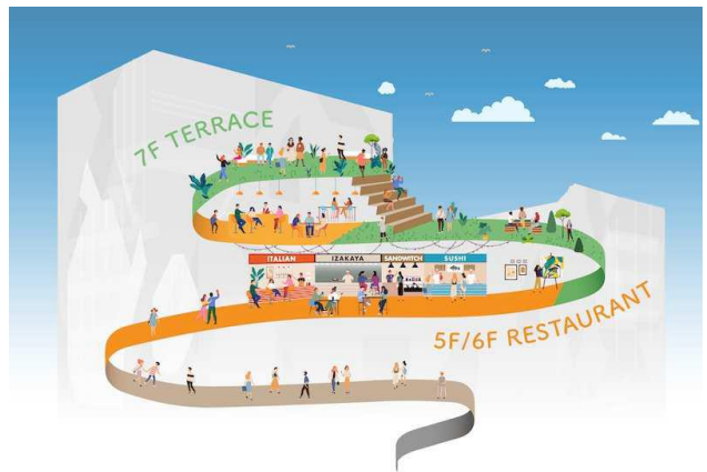
Illustrative image of HARAJUKU KITCHEN & TERRACE

The 5th floor will have an alley-like atmosphere where restaurant interiors inspire creative minds, as well as artworks found here and there. On the 6th floor, people can spend time as they like in the green grass-covered zone seamlessly connected with an open rooftop terrace. In collaboration with Kosugi-yu Harajuku sento public bathhouse on the 1st basement floor is a project called "sento meshi (public bathhouse food, tentative name)" for eating and drinking after taking a bath. Harakado will disseminate such unique food culture. The 5th and 6th floors are open from 11:00 a.m. to 11:00 p.m., supporting both lunch and dinner demand. From the rooftop terrace on the 7th floor, people can overlook Jingumae crossing. In the bustling urban atmosphere, it offers a stunning cityscape and relaxing greenery. The 5th through the 7th floor are named HARAJUKU KITCHEN & TERRACE. With a total floor area of over 2,800 square meters, the food floors and rooftop terrace have 23 restaurants serving diverse cuisines.