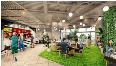
Illustrative image of the 6th floor

Overlooking Jingumae crossing, the rooftop terrace is surrounded by vibrant plants in harmony with greenery in the area, making your stay comfortable.