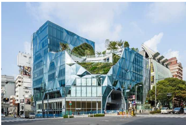
Harakado exterior (daytime view)

*1 Greater Shibuya is an area within a radius of 2.5 km from Shibuya Station as defined in Tokyu Group's strategy to recreate Shibuya.