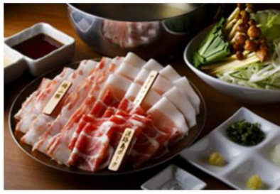
Illustrative image of PRETTY PORK FACTORY & KATSU Prepo menu