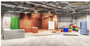
Illustrative image of STEAM STUDIO