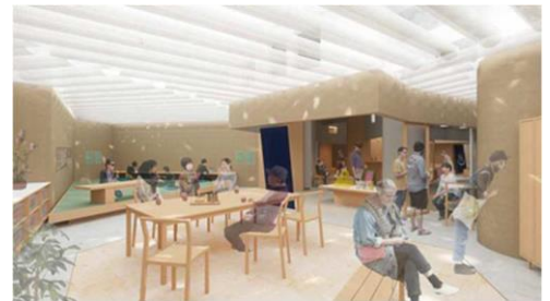
Illustrative image of the event space on the 1st basement floor

The 1st basement floor will house Kosugi-yu Harajuku by Kosugi-yu, a sento public bathhouse in Koenji with 90 years of history since 1933. As a place deeply rooted in everyday life, the sento will be a community space for people "living, working, and playing" in Harajuku. As part of its initiatives to promote co-creation between sento public bathhouse and local businesses, Kosugi-yu will collaborate with diverse businesses and brands as a "local sento," which will lead to deep sharing and powerful spread of information by visitors.