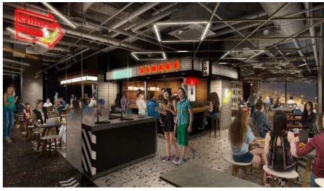
Illustrative image of the 5th floor