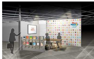
Illustrative image of KanroPOCKeT Lab