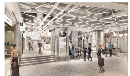
Illustrative image of the 1st floor

The 1st floor will house rit. TOKYO, the first store in Tokyo by a craft chocolate factory from Hiroshima known for carefully selected raw materials, processes, and in-house design work. Hitotubu Kanro will open its second permanent store in Tokyo after the one at Tokyo Station. ALL GOOD FLOWERS will open a circular flower shop