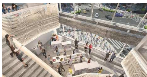
Illustrative image of COVER on the 2nd floor