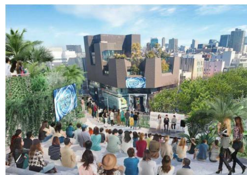
Illustrative image of terrace on the 7th floor and Omokado Vision

The 2nd floor will have COVER, a new event space for collaborative events with magazine feature articles for all ages and genres beyond the boundaries of publishers. It is produced by "Bunkitsu" team of Hiraku, a subsidiary of Nippon Shuppan Hanbai Inc. Tie-ins with multiple feature articles by about 20 magazine publishers will be updated monthly to disseminate fresh information. In addition, the window space facing Jingumae crossing will provide businesses with