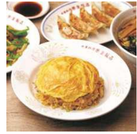
Illustrative image of Shikin Hanten menu

With the theme "Unwind at Jingumae crossing," the 6th floor offers a laid-back "hangout spot" at Jingumae crossing, just because it is a place inundated with cutting-edge trends. This area is seamlessly connected with the open rooftop terrace. People can spend time freely alone or with friends, getting a large plate of food for sharing, or alcohol and soft drinks to go from a selection of 11 unique restaurants.