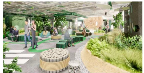
Illustrative image of Harappa on the 4th floor

The 4th floor will be a place where people of all nationalities, genders, and ages can experience various cultures and new forms of entertainment edited in Harajuku's own style. As the first project, the entire floor will be named "Harappa (open field)" with the themes of "nature/chill-out" & "Harajuku experience." Content representing nature and sustainability, including an installation like a bonfire that attracts people to gather around, will be showcased in an area of about 1,030 square meters in front of Jingumae crossing. This will also be connected with TENOHA Daikanyama (in Forestgate Daikanyama), a sustainable activity hub in front of Daikanyama Station, consisting of a cafe and event space.