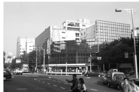
Harajuku Central Apartment

Harajuku/Jingumae area has been a place for top creators of the time to get together and create and disseminate culture, as represented by Harajuku Central Apartment in the 1960s. Since the 1990s, diverse cultures have been created and disseminated across Japan and the world, including street brands that emerged in Ura-Harajuku area, more recent "Harajuku Kawaii culture," and a fusion of street culture with fast fashion and luxury brands.