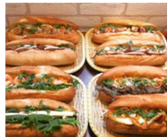
Illustrative image of Bánh mì Sandwich menu