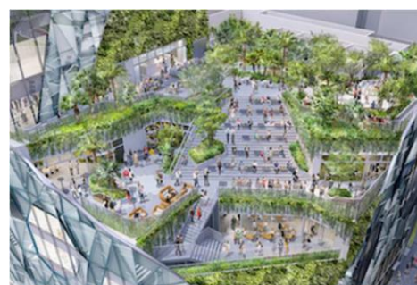
Illustrative image of rooftop terrace on the 7th floor