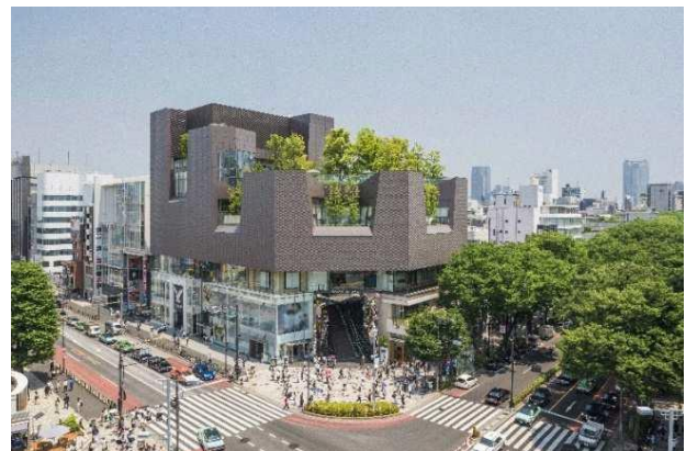
Omokado exterior (daytime view)

Harakado will open as a "place for creating and experiencing new Harajuku culture that inspires diverse people," based on the history of Harajuku/Jingumae area where various cultures have been created, and the current trend that anyone can share and express themselves on social media. To achieve a place for creating and experiencing new Harajuku culture, all the floors from the 1st basement floor to the rooftop terrace will feature a creative scheme that brings together places to "meet," "connect," "experience," and "enjoy" intriguing people, things, and events, as well as 75 ambitious unique shops that share a common passion with Tokyu Land.