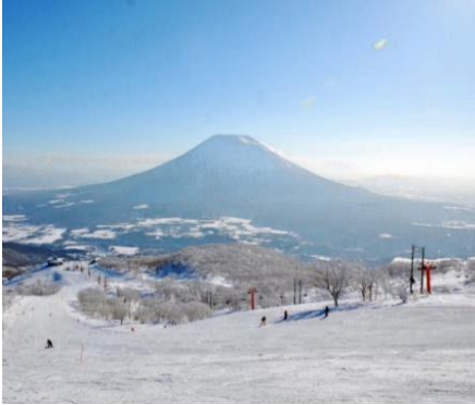
<Hokkaido> Niseko Tokyu Grand Hirafu