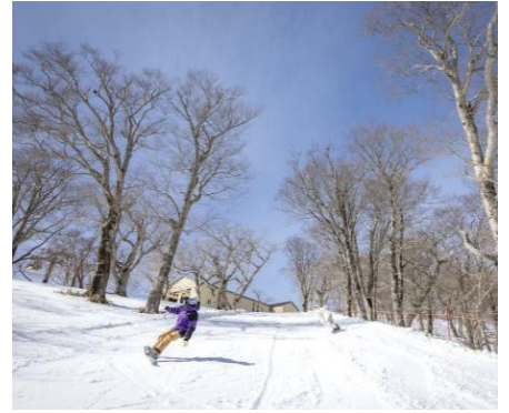
<Tochigi> Nasu Mt. Jeans