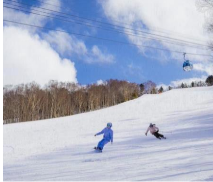
<Tochigi> Hunter Mountain Shiobara