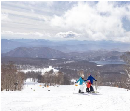
<Gunma> Tambara Ski Park