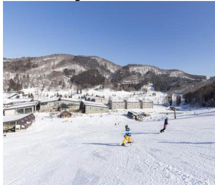
< Nagano > Tangram Madarao