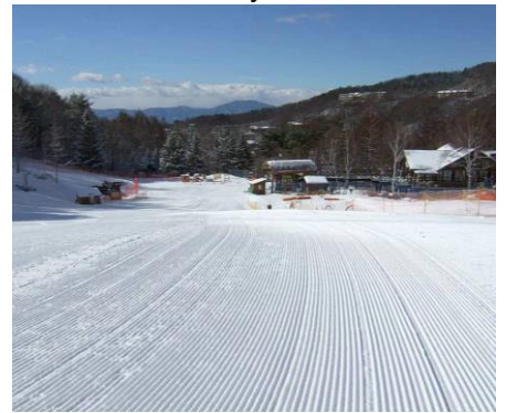
< Nagano > Tateshina Tokyu Ski Resort