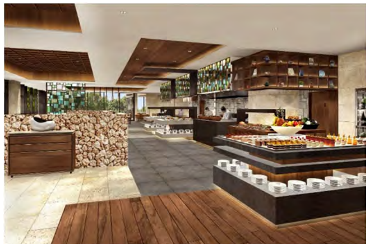
All-Day Dining Venue (rendering)