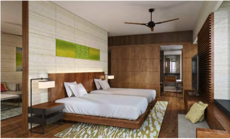
Ocean Corner Suite (illustrative purposes only)