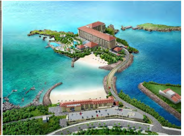
Aerial View of the Resort (rendering)