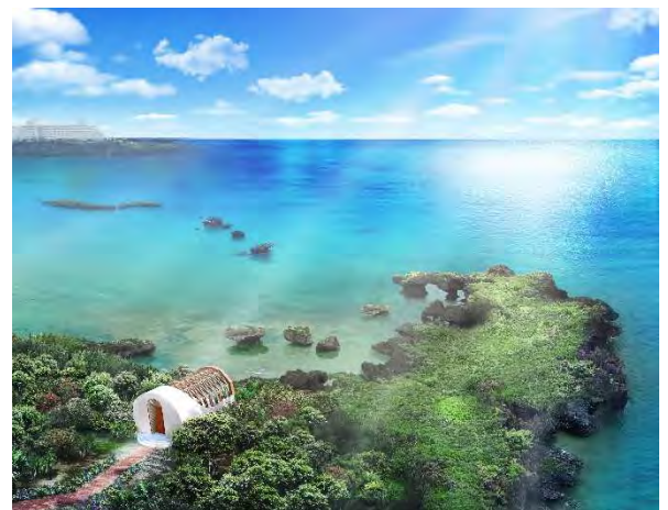
Aerial View of Seragaki Island Chapel (rendering)